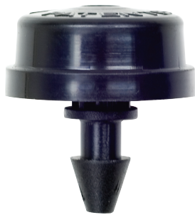
BUTTON DRIPPER (BD)

ADAPTABLE TO MANY APPLICATIONS - POSITION THE DRIPPER EXACTLY WHERE IT'S NEEDED