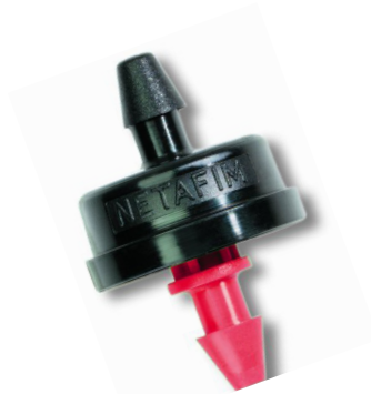
WOODPECKER DRIPPER (WP)