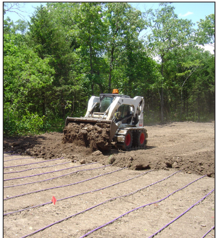
Imported soils being installed in 6” lifts with tracked vehicle.