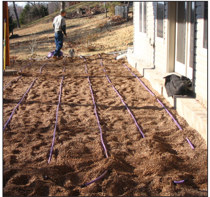
Netafim Bioline® is laid across the top of the soil in even rows. (Note the proximity of the dripperline to the home's foundation and doorway. Drip dispersal is family-friendly.)