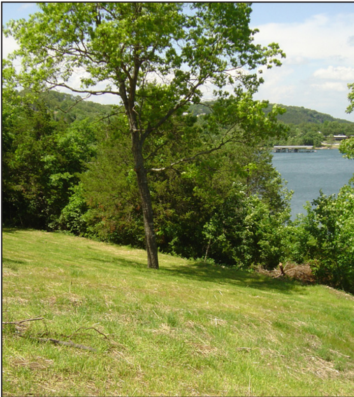
This homeowner enjoys a drip dispersal system that applies the effluent safely and evenly across the dispersal area along with an additional benefit - free irrigation water to keep the grass green.