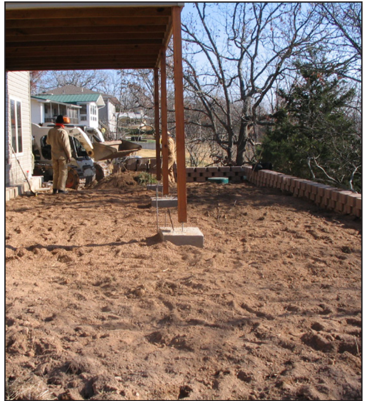
Imported soils are put into place.

Once the characteristics of the imported soil have been identified and the field is sized, it is ready to bring the soil to the project and install it.