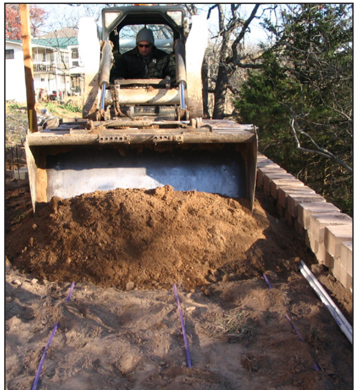
A quality soil is installed across the dripperlines - whenever possible it is recommended to place soil in 4" to 6" lifts. This keeps the loading parallel to the dripperlines to avoid shifting the rows.