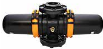
3" TWIN LITE