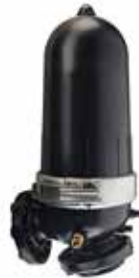
3" ANGLE FL