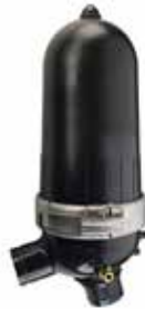
3" ANGLE GR