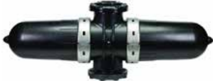
4" OR 6" TWIN