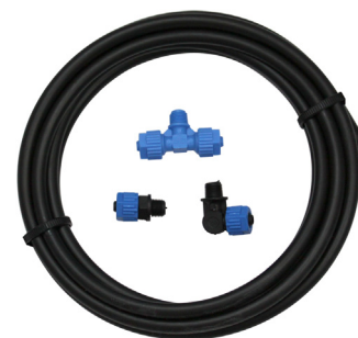
8MM FITTINGS & CONTROL TUBING

We strongly believe this upgrade has many positive advantages. By streamlining the wide variety of valves Netafim offers, we are able to improve delivery times, inventory management, logistics and after-sale support. In essence, we will be able to serve our customers better.