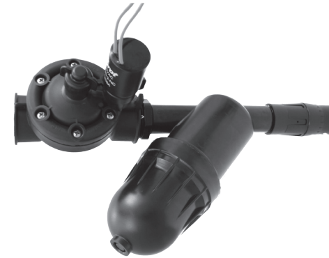
WITH CONTROL VALVE