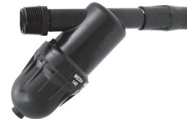
WITH NO CONTROL VALVE