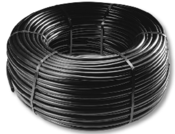
1,000' Length Coil of Polyethylene Tubing

Stringent Quality Controls Assure the Highest Manufacturing Standards – Delivering the Highest Quality Products