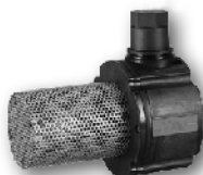
Check Valve with Foot Valve