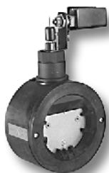
Check Valve with Electric Limit Switch