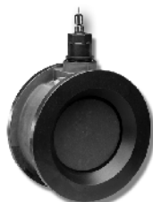
Check Valve with Indicator Stem