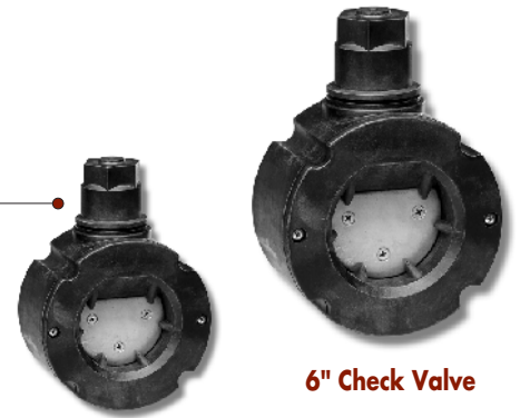
3" Check Valve