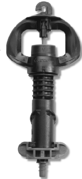
SuperNet (Shown without Stake)