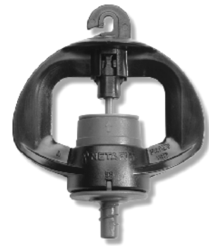
SuperNet Jr. (Shown without Stake)