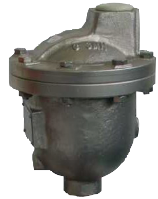
Ductile Iron Model for Gold Mines