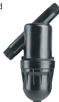
3/4" MANUAL DISC FILTER