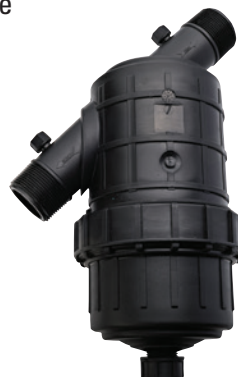
1 1/2" MANUAL SCREEN FILTER