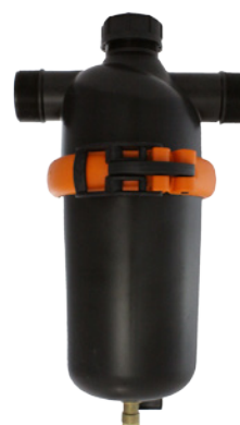
2" DUAL LITE MANUAL DISC FILTER