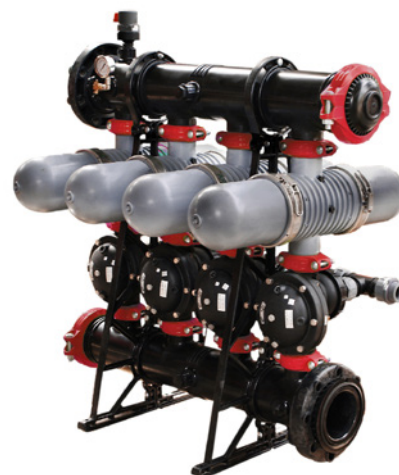
3" LP DISC-KLEEN FILTER