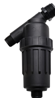
3/4" MANUAL SCREEN FILTER