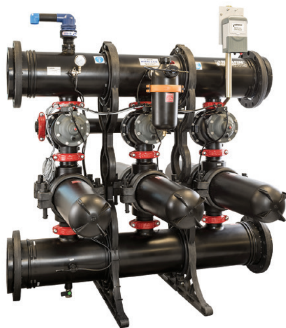
APOLLO 3 TWIN DISC-KLEEN FILTER