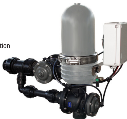
2" COMPACT LP DISC-KLEEN FILTER