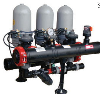
2" LP DISC-KLEEN FILTER