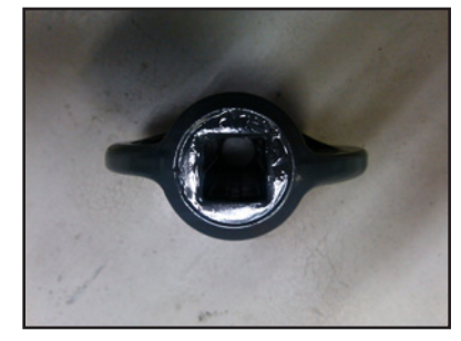
Square end denotes top of disc