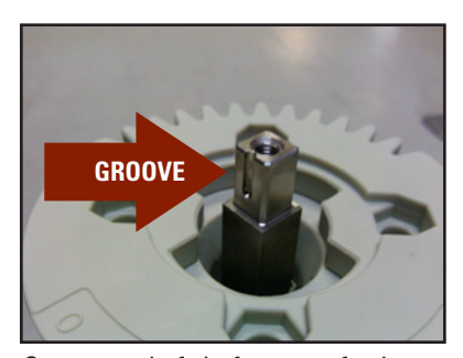
Square end of shaft at top of valve

TIP 4: When installing the shaft, the square end of the shaft must be oriented at the top of the valve body. Notice the groove at the top of the shaft (square end). This groove needs to be on the opposite end from the gasket flap. See pictures below.