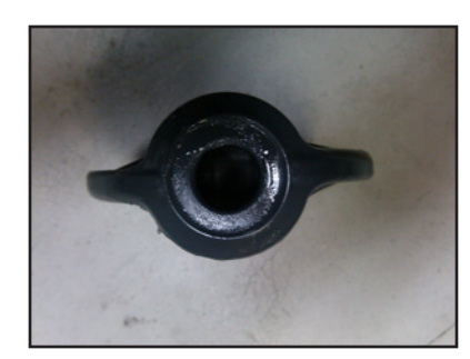
Circular end denotes bottom of disc