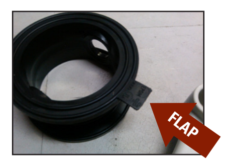
TIP 2: When installing the gasket, ensure that the gasket flap is aligned with the notch on the body.

TIP 1: Torque Ratings for Bolts Handle bolt: 50 in-lbs. Top plastic 4 bolts: 25 in-lbs. Bolt on bottom of shaft: 50 in-lbs.