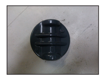
TIP 3: Notice that the disc has a square and circular end. Install with the square end facing the top of the valve.