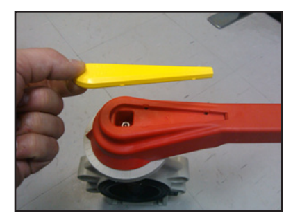
STEP 2: Remove the bolt under the yellow insert with a 5mm Allen key. Once the bolt is removed, the handle can be separated from the valve.