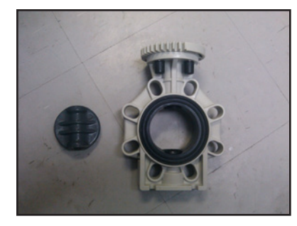
STEP 6: Remove the top plate. After removing the protective caps, use a 13mm wrench to remove the nuts. Once the bolts are free, the top plate can be separated from the body.