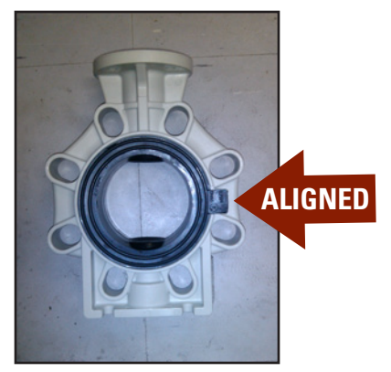
Gasket in Proper Alignment