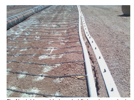
FlatNet laid out with threaded fittings inserted prior to drip laterals being connected and FlatNet with drip laterals connected and at operating pressure.