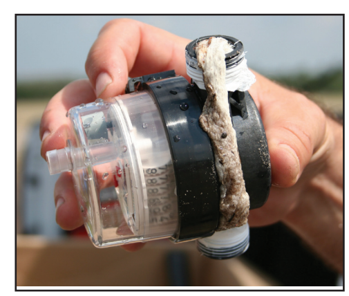
Figure 6. Filamentous sulfur slime completely clogging a small water meter.

Sulfur slime is a yellow to white stringy deposit formed by the oxidation of hydrogen sulfide. Hydrogen sulfide (H2S) accumulation in groundwater is a process typically associated with reduced conditions in anaerobic environments. Sulfide production is common in lakes and marine sediments, flooded soils, and ditches; it can be recognized by the rotten egg odor. Sulfur slime is produced by certain filamentous bacteria that can oxidize hydrogen sulfide and produce insoluble elemental sulfur.