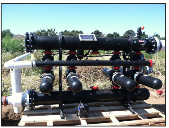
Figure 2. Example of a Netafim Apollo Disc-Kleen Filter

In general, screen filters are suitable only for very clean water sources. Sand media and disc filters which utilize depth filtration are most effective at removing suspended particles from the water. The filter system should be setup to automatically clean when the pressure differential across the media is too large. A pressure differential switch in combination with a flushing controller is a common approach for automation of filter cleaning.