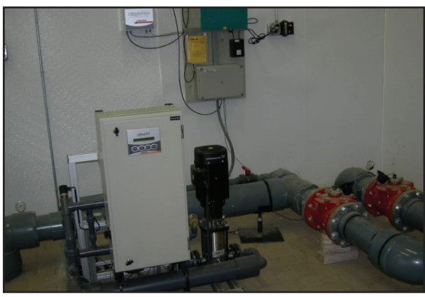
Figure 4. Fertilizer Injection system