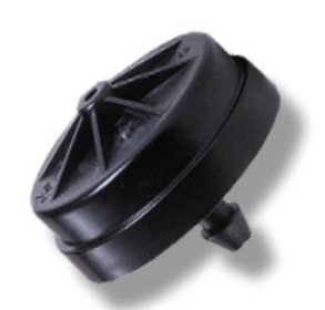
PRESSURE COMPENSATING (PC) NON CNL