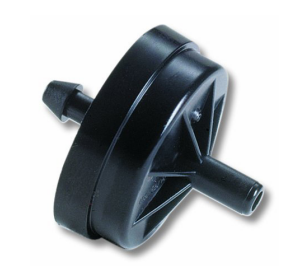
WOODPECKER PRESSURE COMPENSATING (WPC) NON CNL