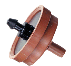
WOODPECKER PRESSURE COMPENSATING (WPC) WITH CNL