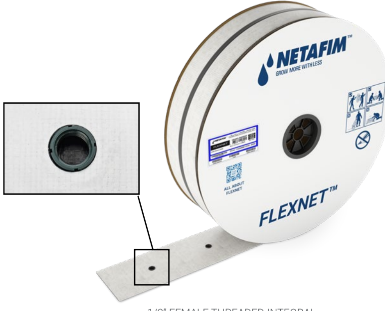
1/2" FEMALE THREADED INTEGRAL WELDED OUTLET/CONNECTOR