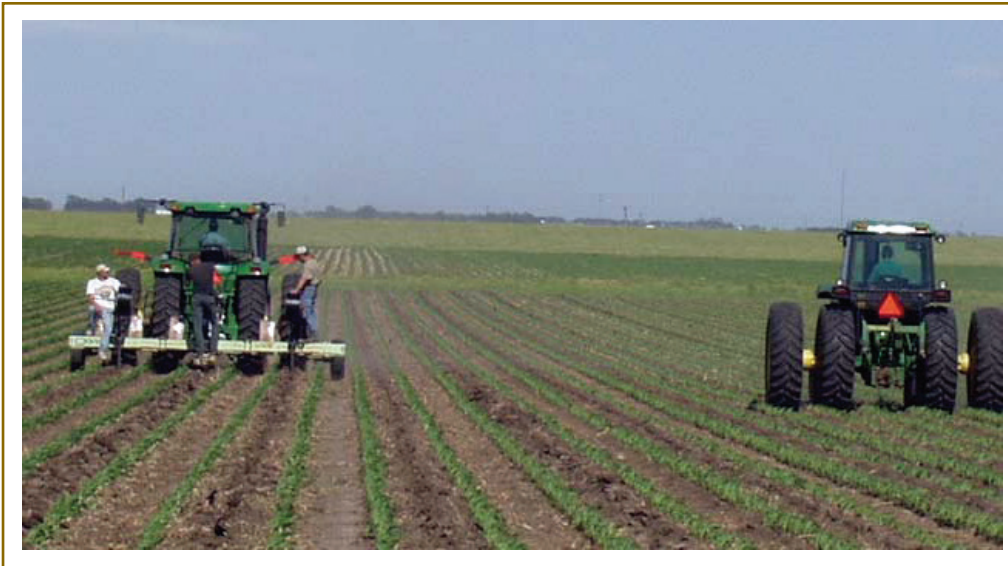
FIGURE 1 Tractor on left installing thinwall dripline while tractor on right packs soils left open by shank.