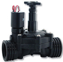
1" ELECTRIC PBI THROTTLING NYLON VALVE

PROVEN PERFORMANCE WITH A SIMPLE LOW MAINTENANCE DESIGN