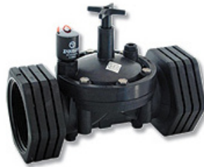
323 ELECTRIC PBI THROTTLING NYLON VALVE