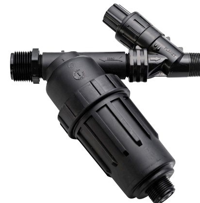
WITH NO CONTROL VALVE