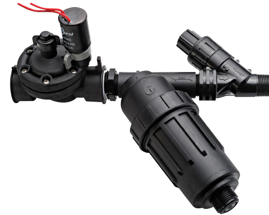
WITH CONTROL VALVE