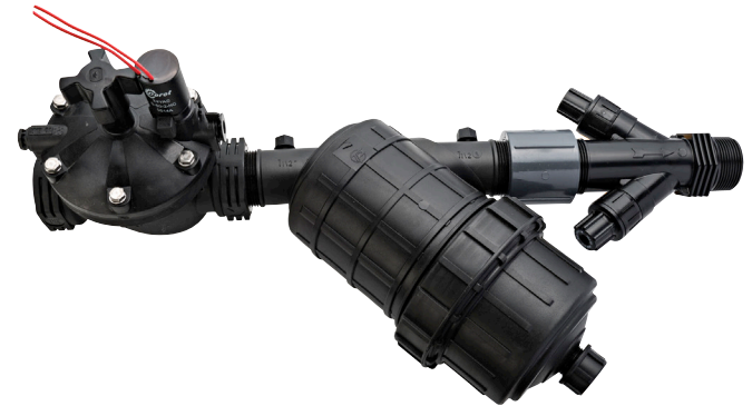
WITH CONTROL VALVE