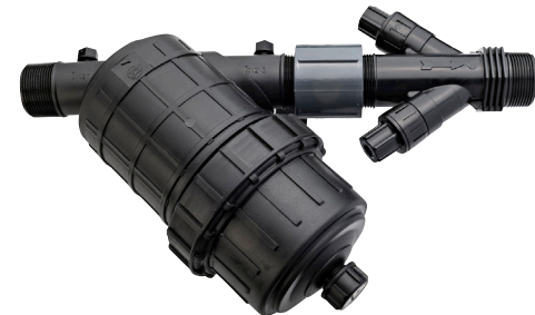
WITH NO CONTROL VALVE