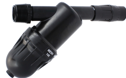
WITH NO CONTROL VALVE