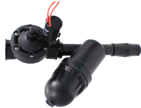
WITH CONTROL VALVE