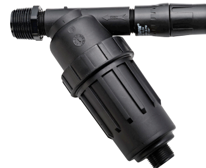
WITH NO CONTROL VALVE