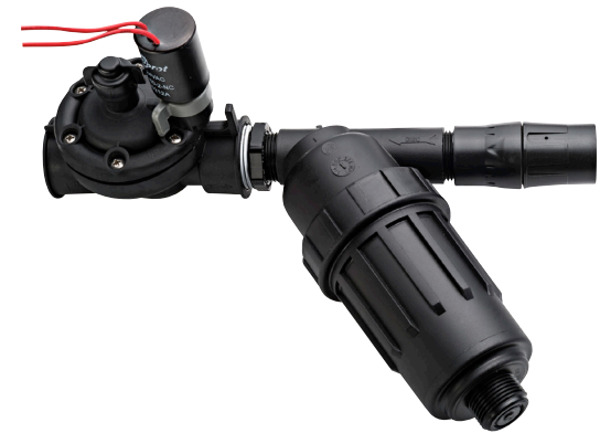
WITH CONTROL VALVE