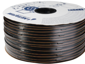
SDI puts water and nutrients directly in the plant's root zone

He attributes that to using driplines to inject fertilizer into corn root zones when plants are only a foot tall and roots about a foot long. He said his no-till, holistic system keeps levels of organic matter high and may be a factor in why he's getting by without starter fertilizer.