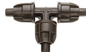
TECHLOCK TEE Model TLCKTEE