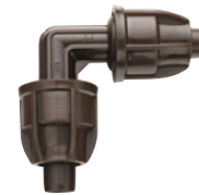
TECHLOCK ELBOW Model TLCKELL