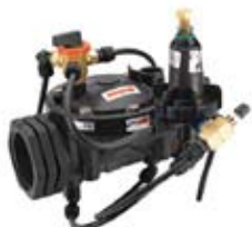
NYLON - THREADED