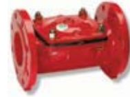
IRON - FLANGED