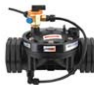
NYLON - THREADED

High Pressure Diaphragm: recommended if dynamic pressure is always above 30 psi.