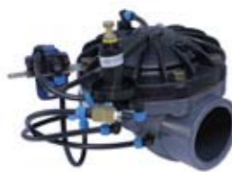
PVC - SLIP