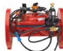
IRON - FLANGED