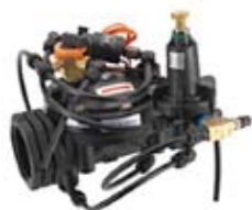
NYLON - THREADED