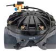
PVC - SLIP