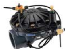
PVC - THREADED